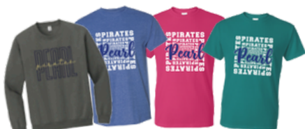
Pearl Upper Elementary