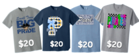
Pearl Junior High School