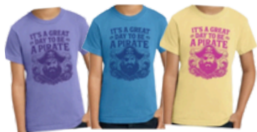
Pearl Lower Elementary